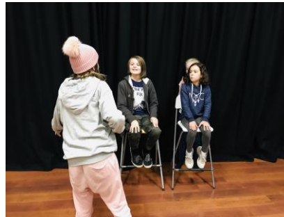
King and Queen Exercise