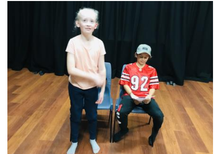
Script Work – Small Scenes