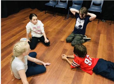
Group Creations – Self Devised Theme Tasks