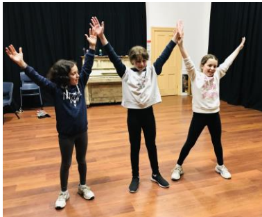
End of Improvisation

The Quirk workshops are giving the ensemble the courage to be themselves in a non-judgmental space. We are looking forward to creating our own self-devised play next term.