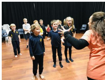
What's the time Mr. Wolf?