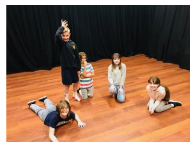
Creating emotion machines

"My boys are loving your workshop, they said you are a great teacher who gives them a fun, safe place to be who they want to without any judgement" – Parent