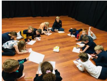
Writing group norms