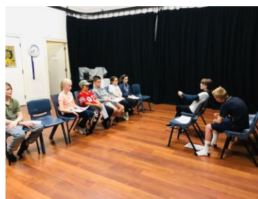
Performing short scenes to the class