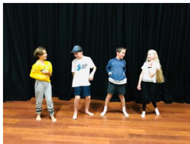
Creating a story one word at a time